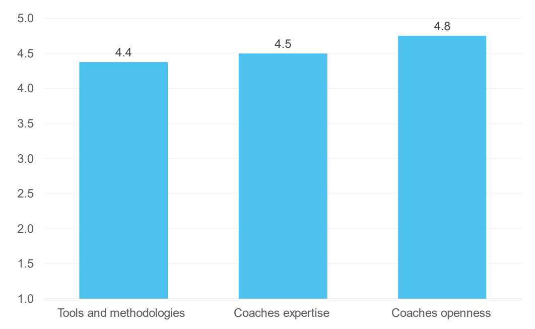
Figure 2: Coaching and mentoring sessions Weighted average scale (maximum 5 points), rating by participants

Moreover, respondents appreciated the coaches' openness to listen to questions and responses to their doubts, as well as their technical expertise. The tools and methodologies were also well rated. Figure 2 shows the high rate attributed to these elements by participants.